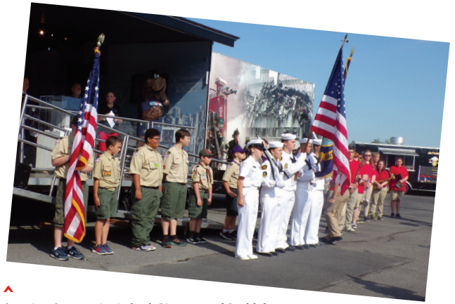
Opening Ceremonies in both Pittston and Bethlehem included the Pledge of Allegiance and National Anthem.

To view additional event photos visit GIVEaPINT.org/tunnel-to-towers .