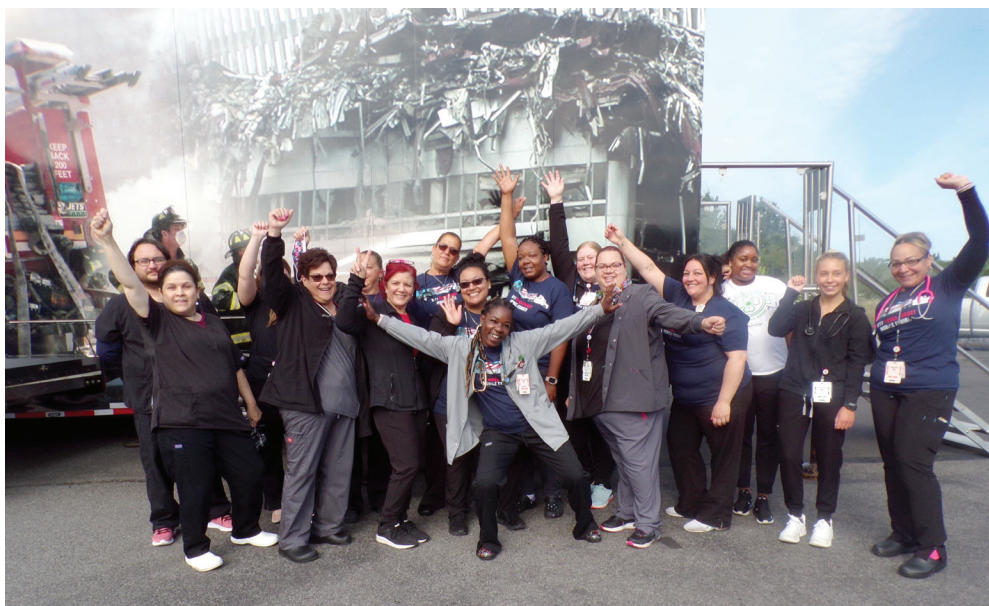
MKBC's amazing Donor Collections Staff take a break to smile for the camera during the Tunnel to Towers event.

Angels on Call Behrens Family Cartwright for Congress Community Bank Firstnet Lehigh Valley Health Network One Point Corporate Environments Rotary Club of Mountaintop ShopRite US Hydrations Waste Reduction & Recycling