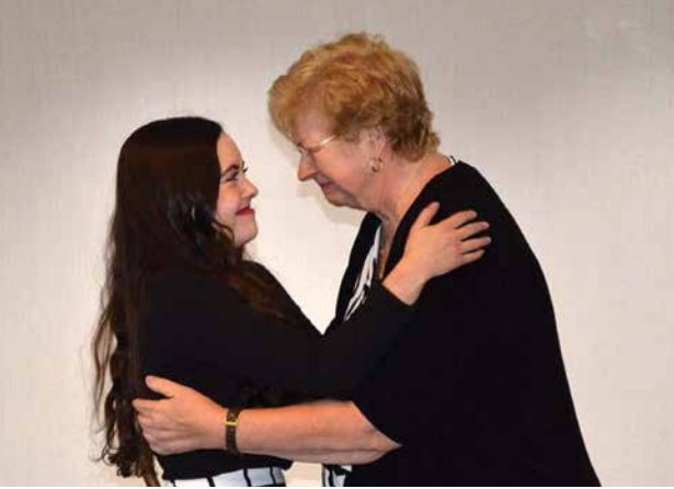
MKBC’s “Celebrate Hope” program unites a transfusion recipient with some of the actual blood donors whose selfless generosity saved his/her life.