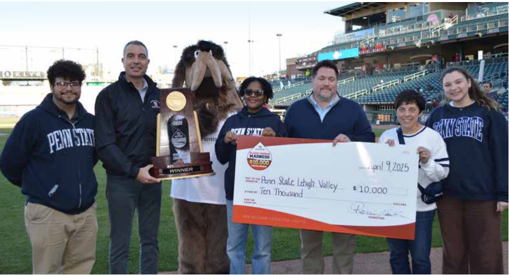
Congratulations to Penn State Lehigh Valley, the 2025 MKBC Blood Donor Madness champion!

"Blood is perishable and it cannot be manufactured," she explained. "It can only be given through the generosity of volunteer blood donors who make time in their busy schedules to visit a donor center or blood drive to give the gift of life." For more information on the inaugural Blood Donor Madness competition, visit GIVEaPINT.org .