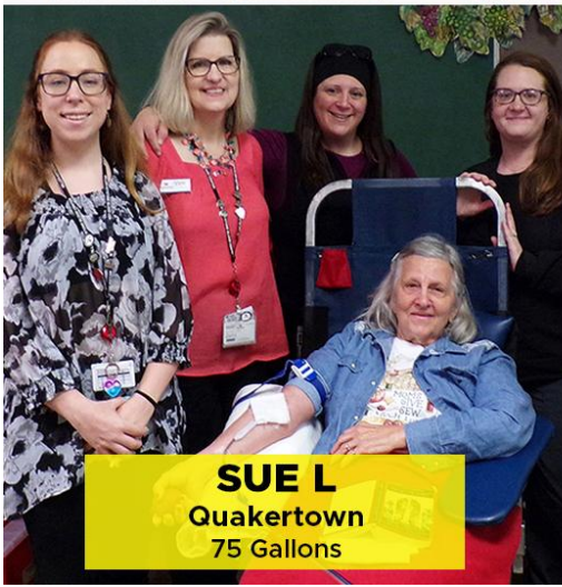
SUE L Quakertown 75 Gallons